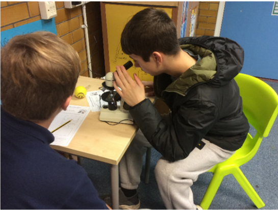
We also learnt to use microscopes.

We built models of DNA by using the code for our own names - each letter represents an amino acid. Fascinating stuff and tasty too as we used sweets to represent the nucleotides Adenosine, Thymine, Cytosine and Guanine.